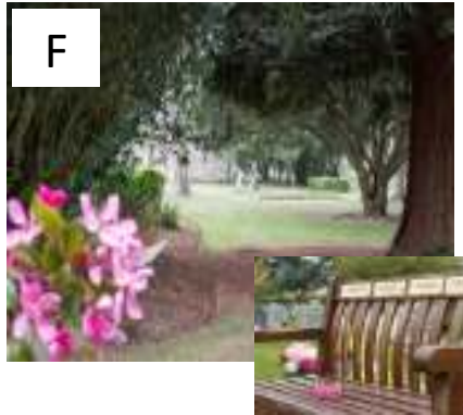
A: Lawned & Traditional Heritage Grave C: Cremated Remains (Small Headstone - headstone shown inset) F: Memorial Garden (Scattered remains—memorial bench shown inset)