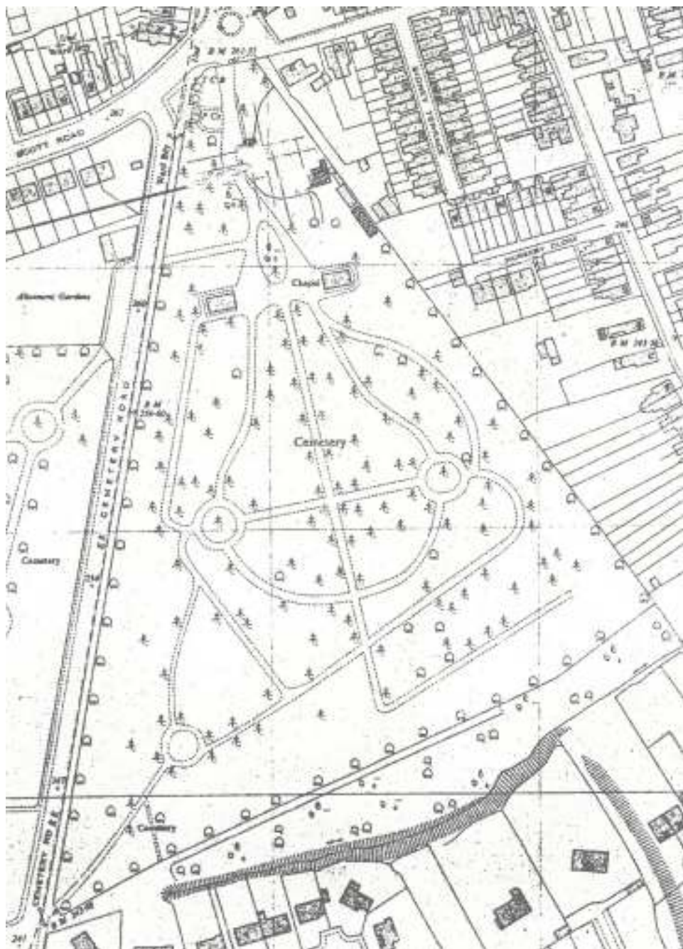
Undated Ordnance Survey map showing the Old Cemetery and part of the New Cemetery